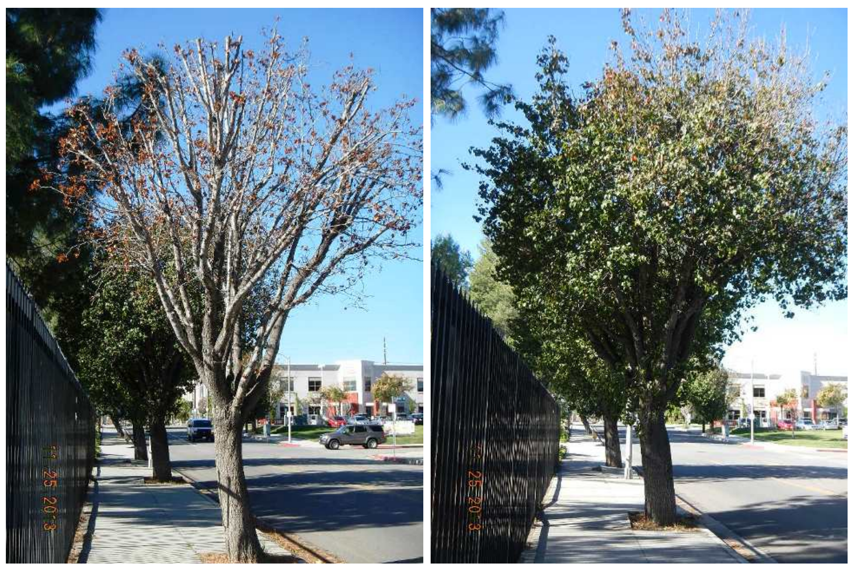
A dead Bradford pear.