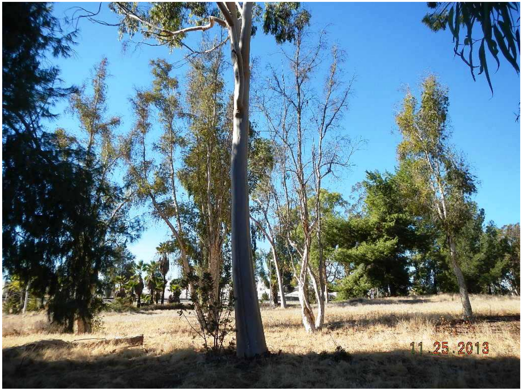
Paperbarks need more water and are declining in most areas.