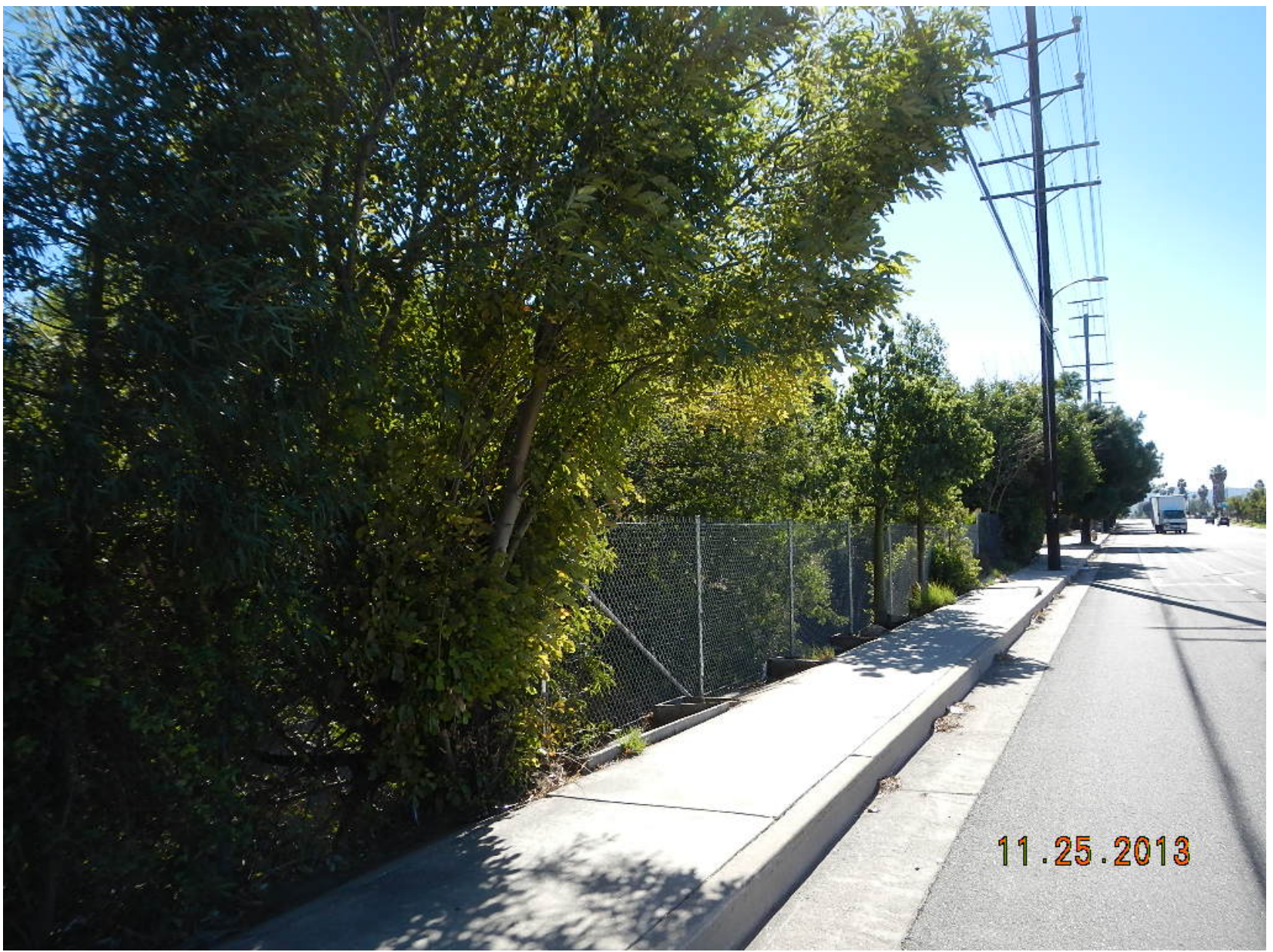
Shamel ash are growing in tight spots along both sides of the channel.