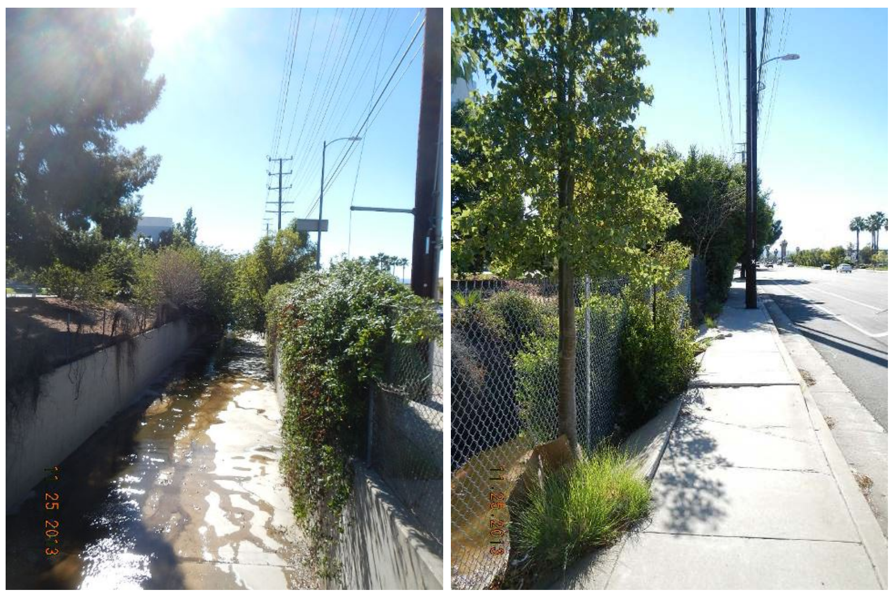
Looking south down the flood control channel.