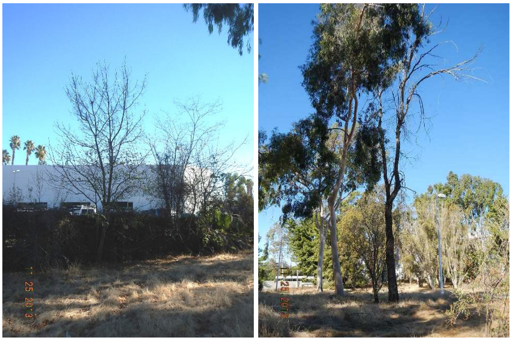
More Shamel ash weed trees along the southeast edge.