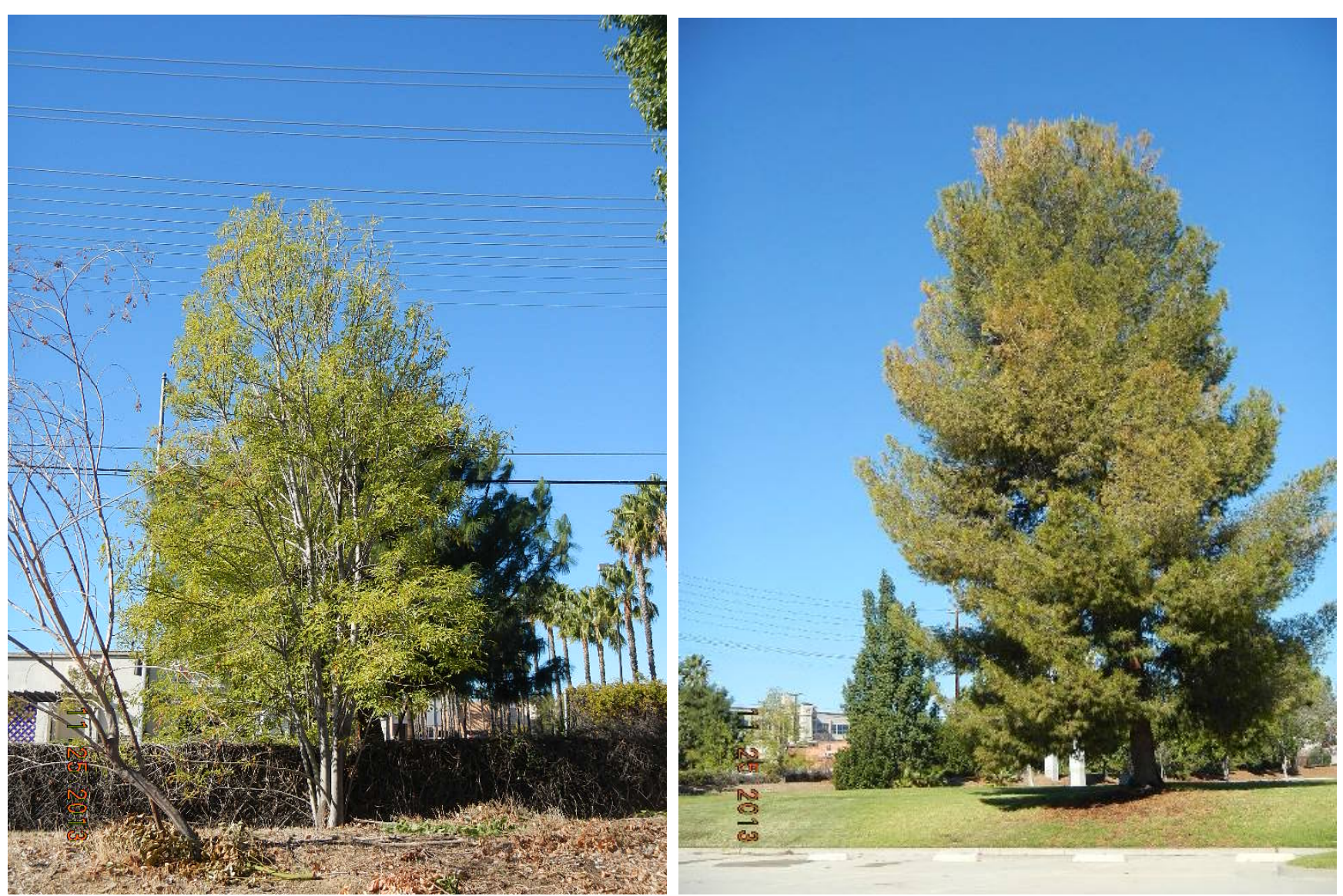
All the Shamel ash are weeds along the edge of the channel or east wall. The browning of this Aleppo pine is probably due to a mite infestation.