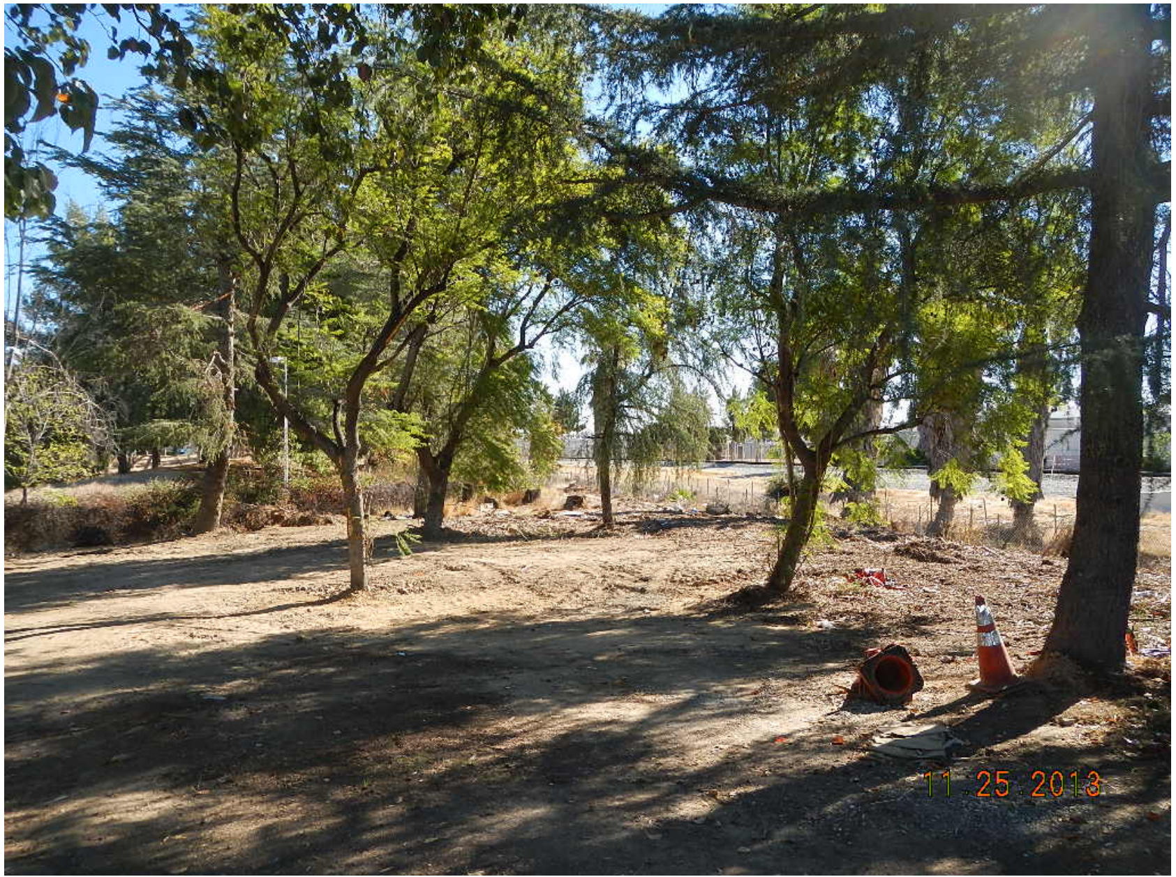
This fresh fill will soon begin to affect the health of these trees adversely.