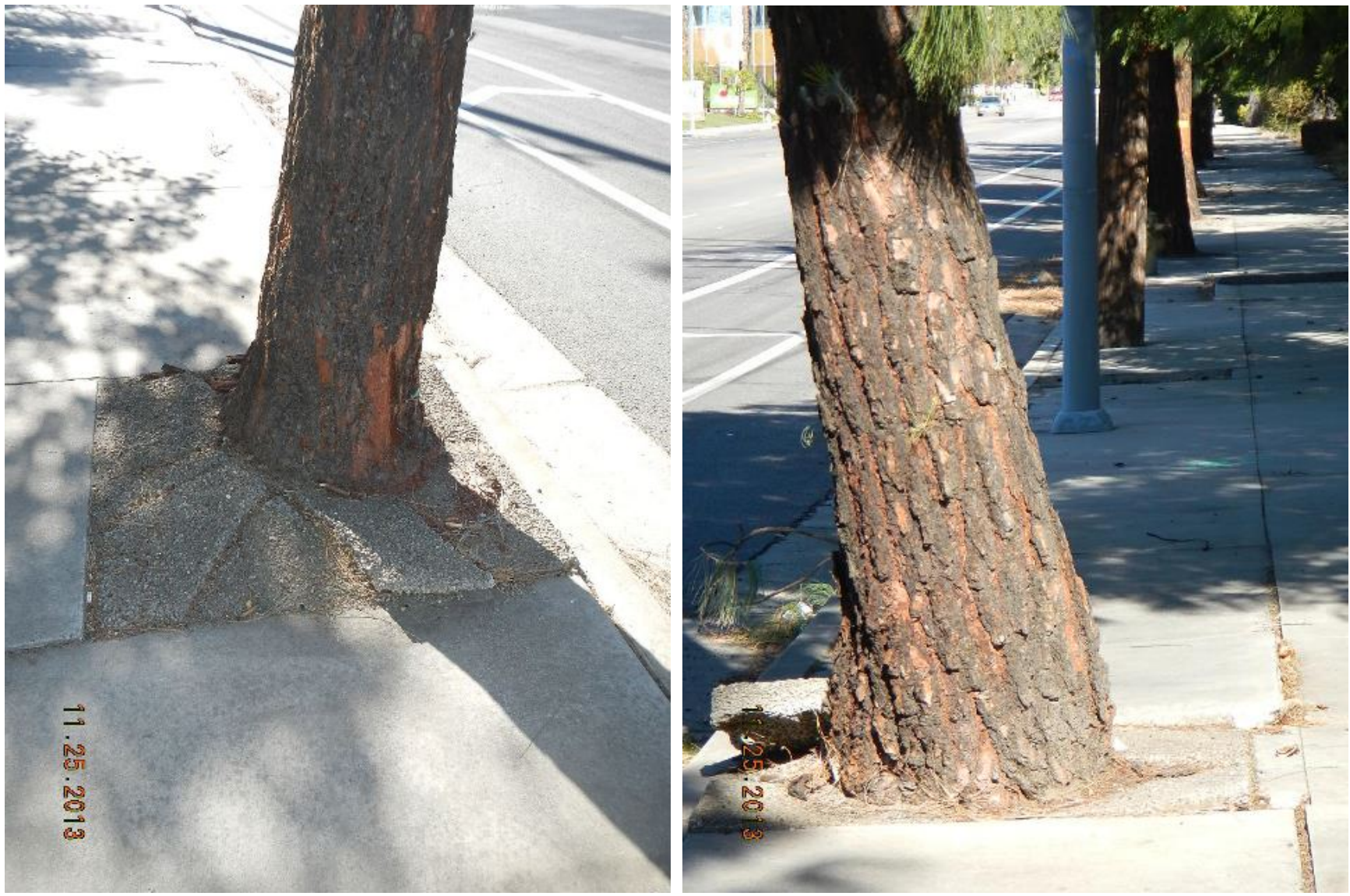
The tree wells are also too small for these pines.