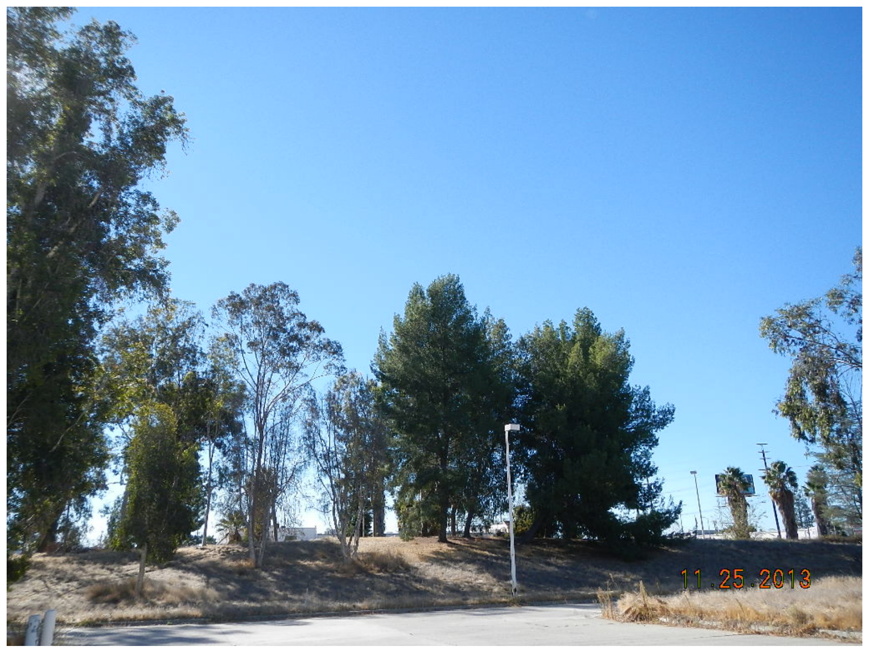
West corner of the southern portion. The sparse trees in the foreground are paperbarks and behind are the lemon gums.