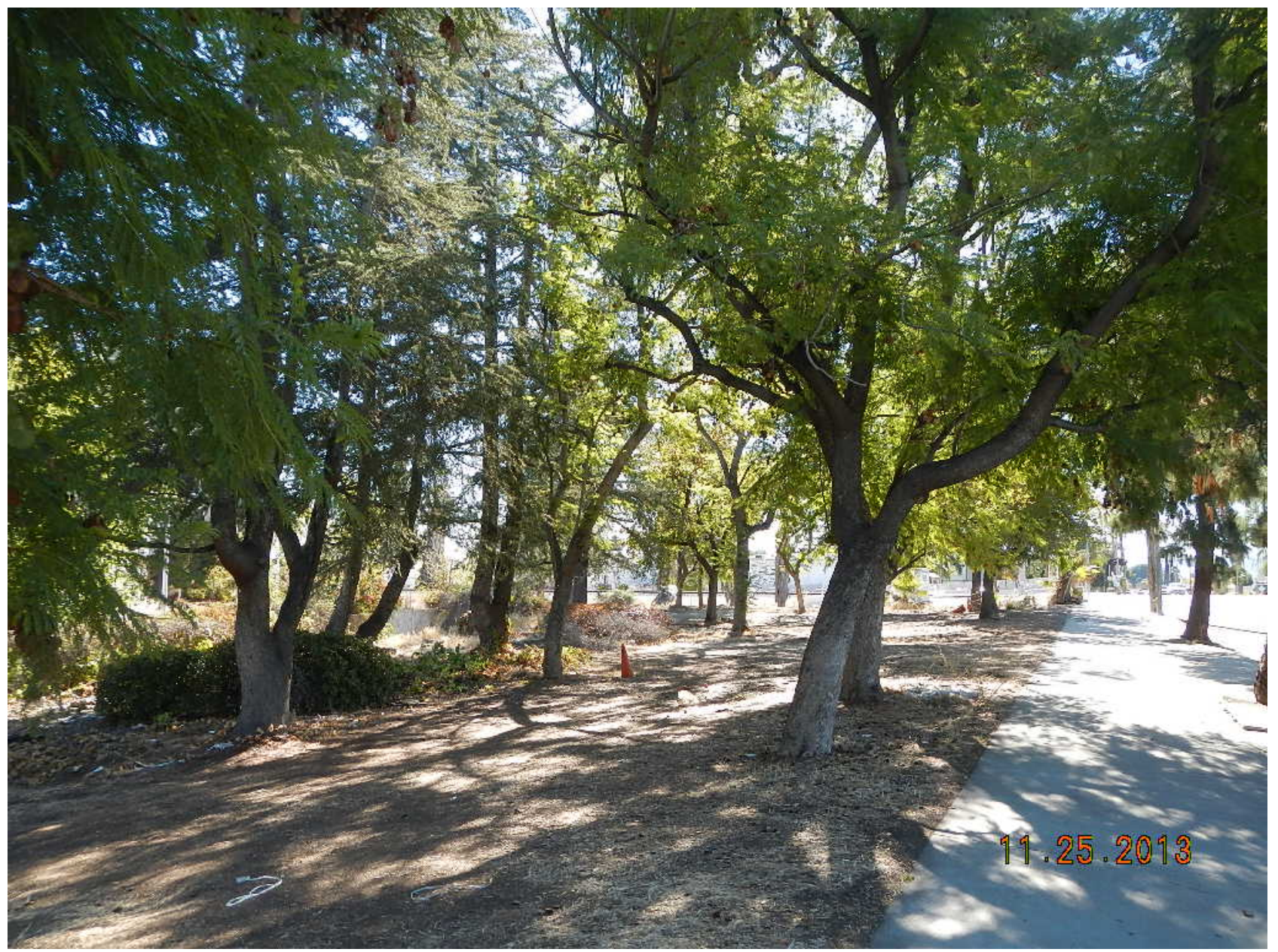
Many of the trees at the south end of the western strip are over-crowded and have awkward form.