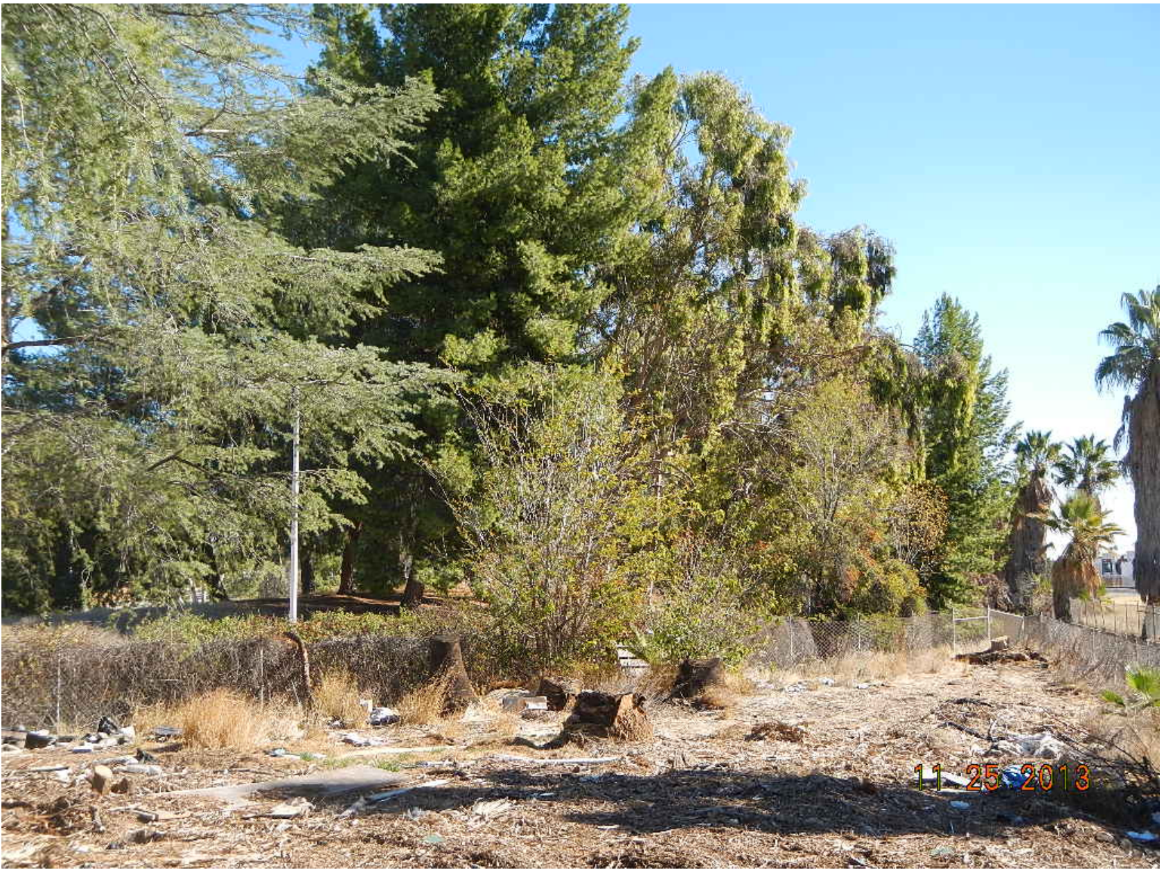
Note the burned stumps of Mexican fan palms just south of the channel.