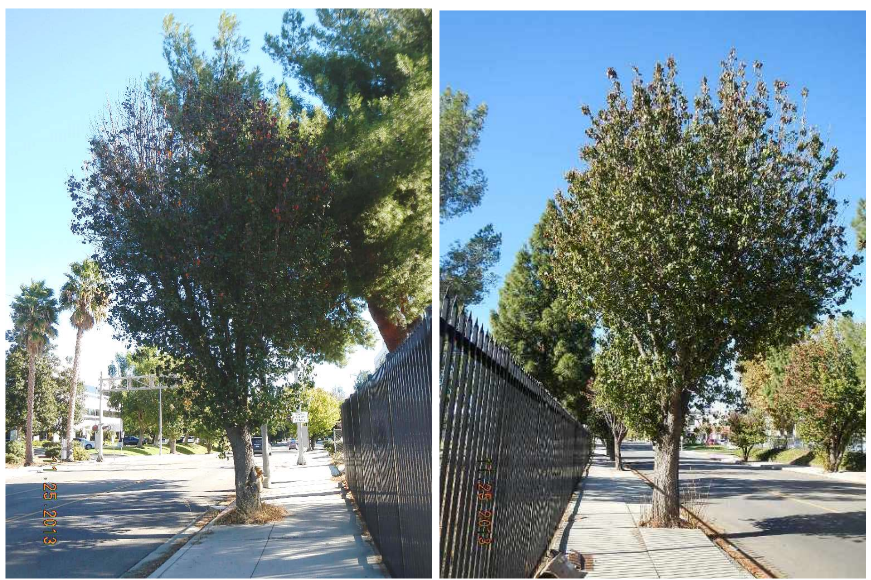
The Bradford pears are lifting the sidewalks and structurally weak. Their openings could be enlarged, but they are not long lived.