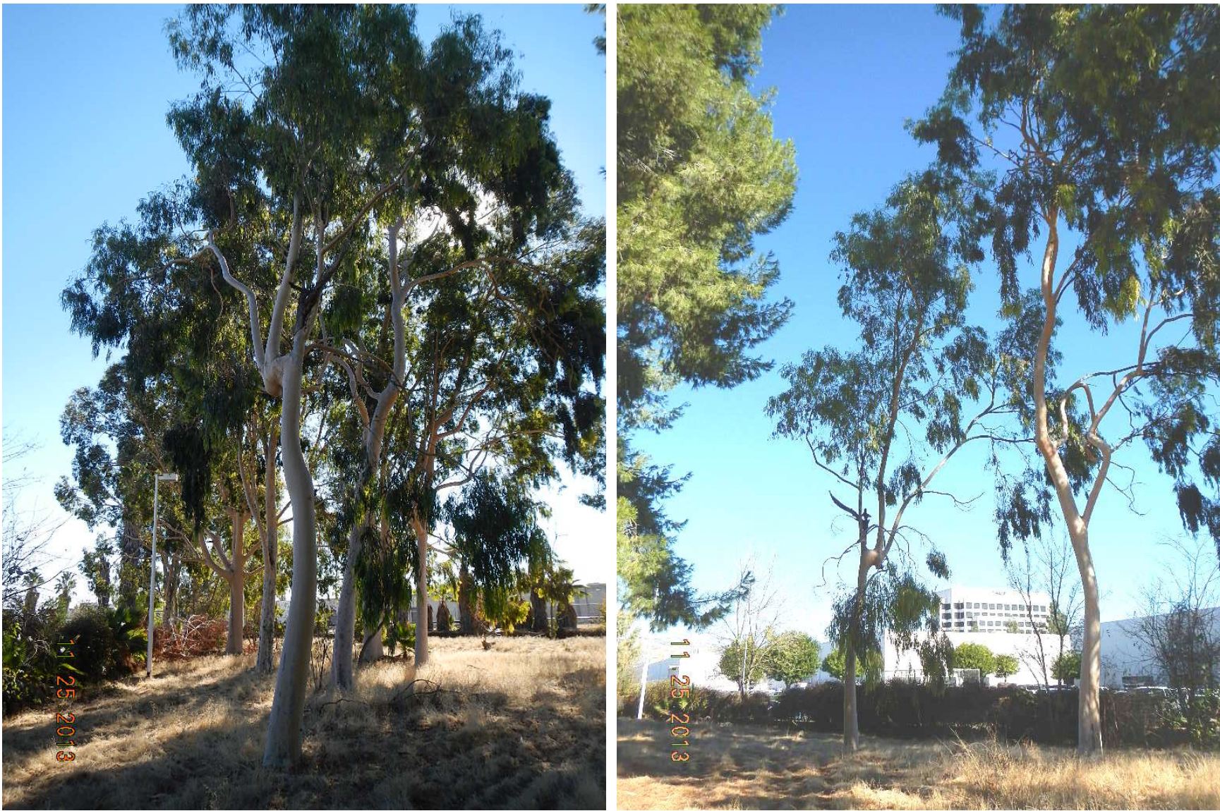
Lemon gums along the southeast edge are healthy but weak structurally.