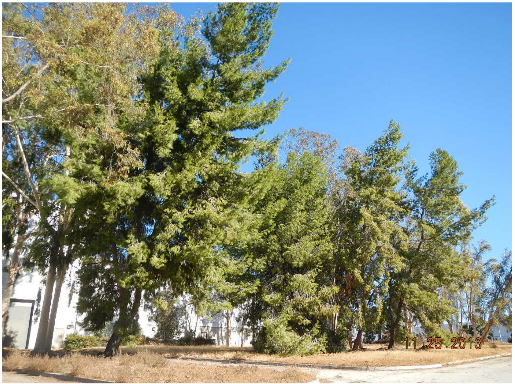
The pines lean out away from the building.