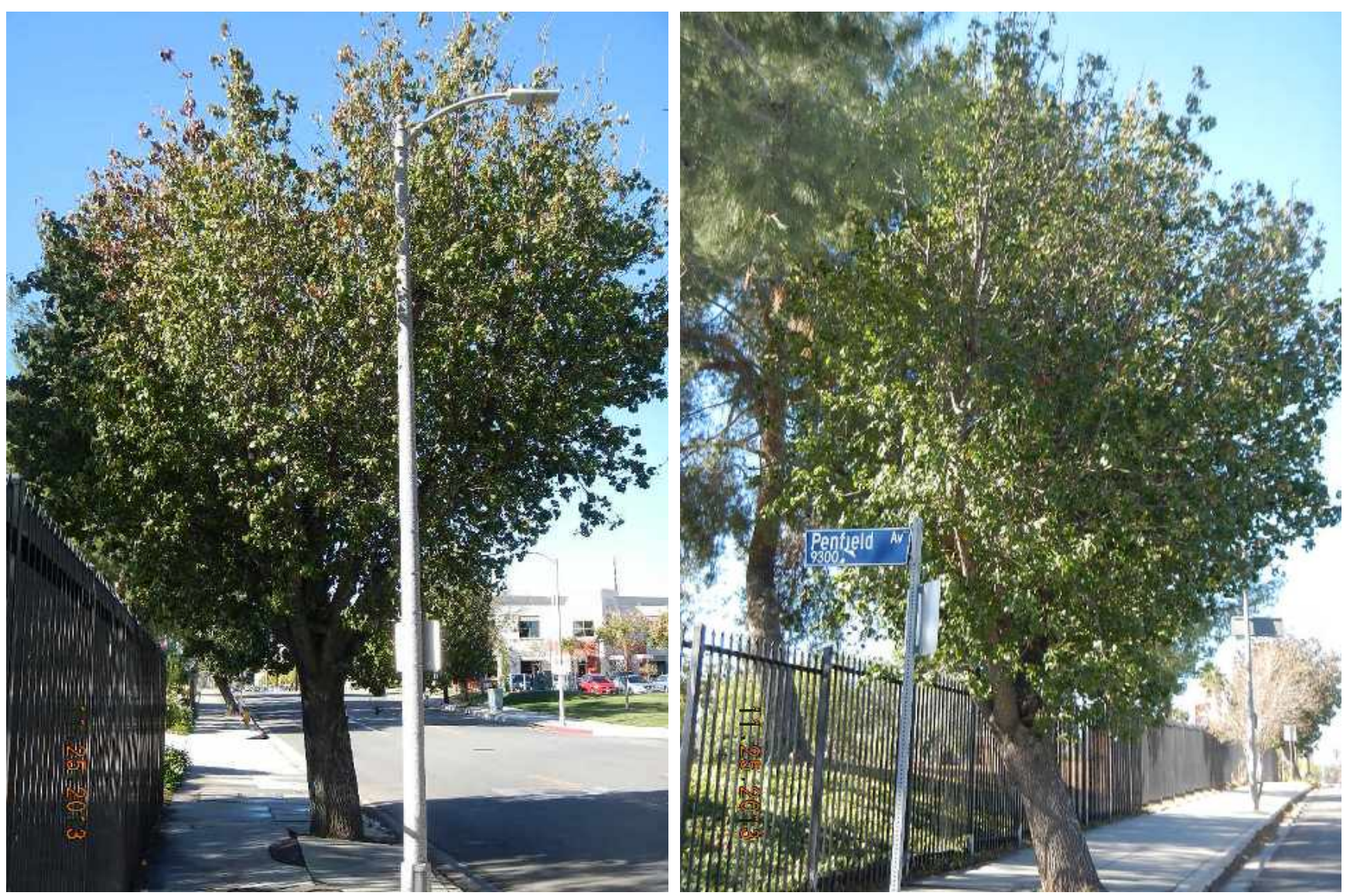
Note the lifted sidewalk.