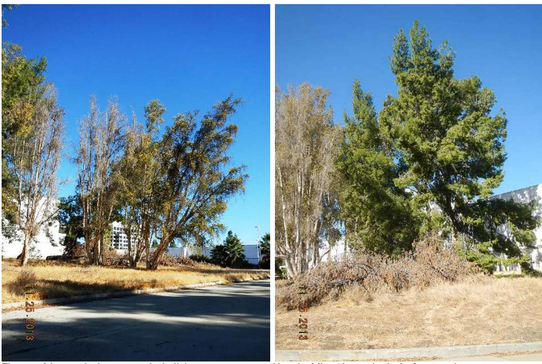
The rest of the paperbarks are severely declining.