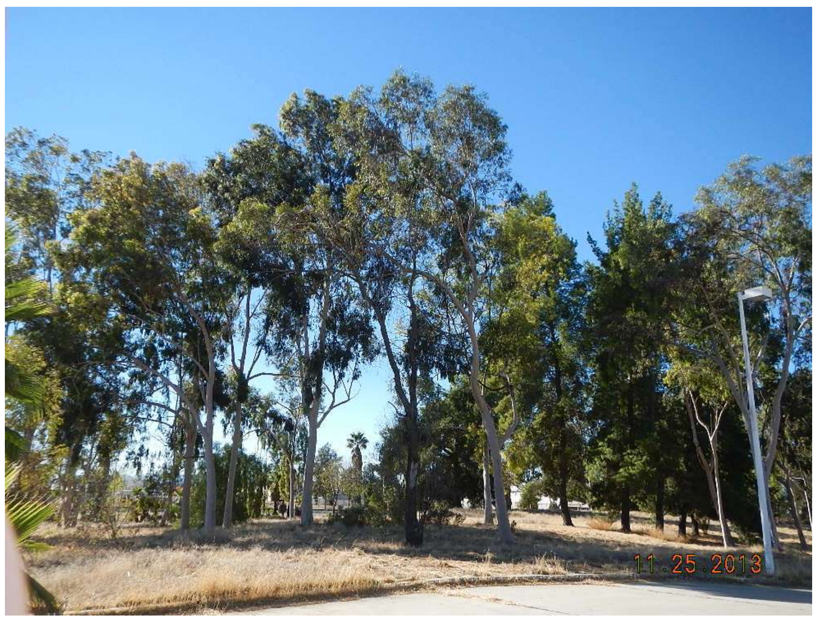
The lemon gums are healthier on the east side of the southern portion.