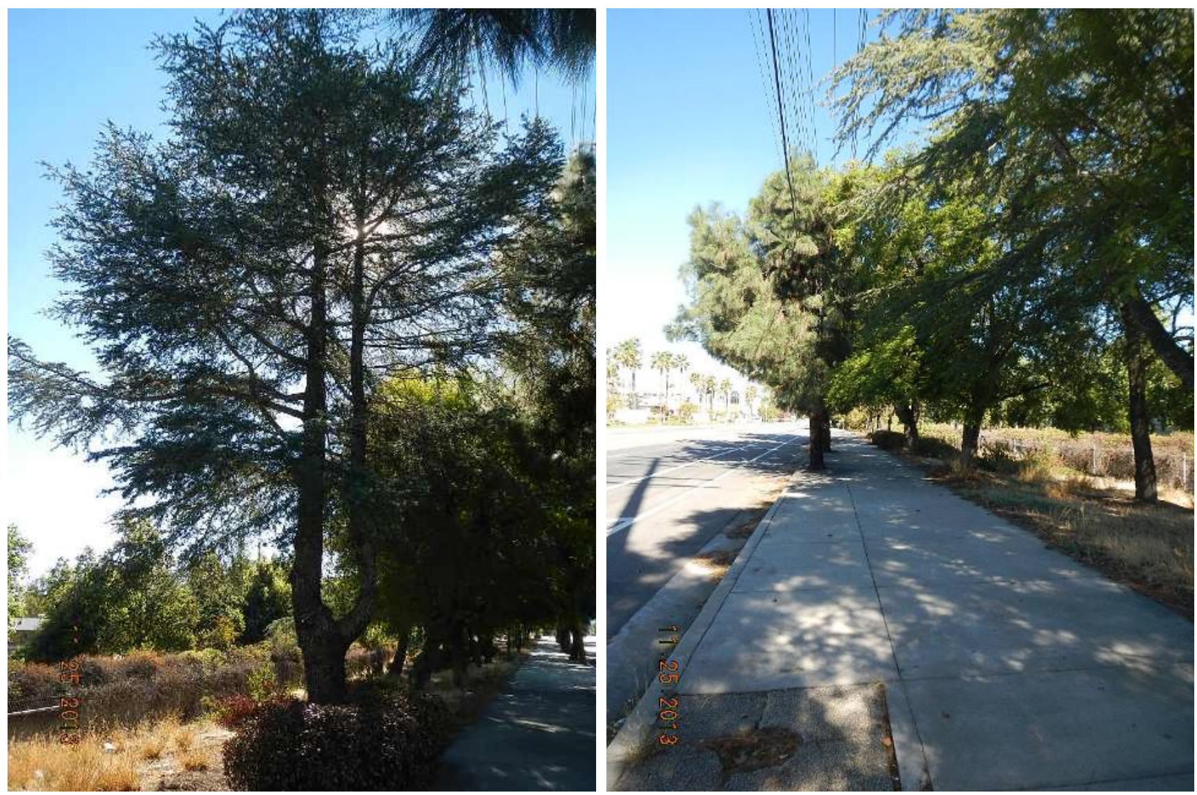
Many of the deodars were topped and codominant.