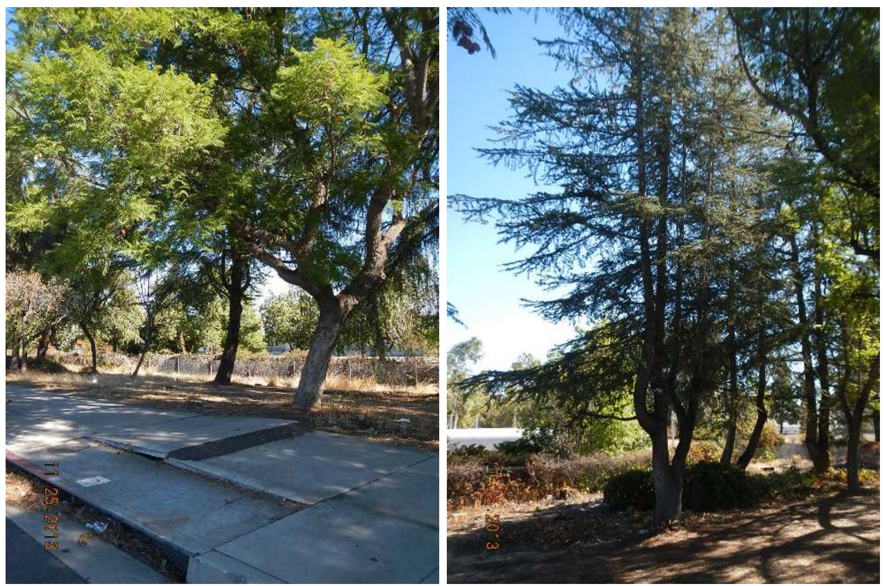
This larger jacaranda is lifting the sidewalk.