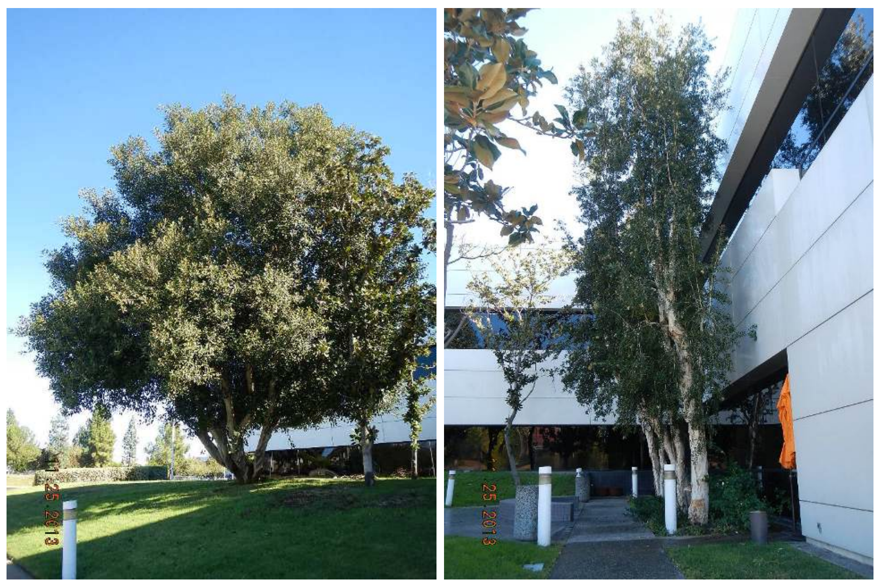
The large ficus is very healthy, but has shallow roots and weak structurally.