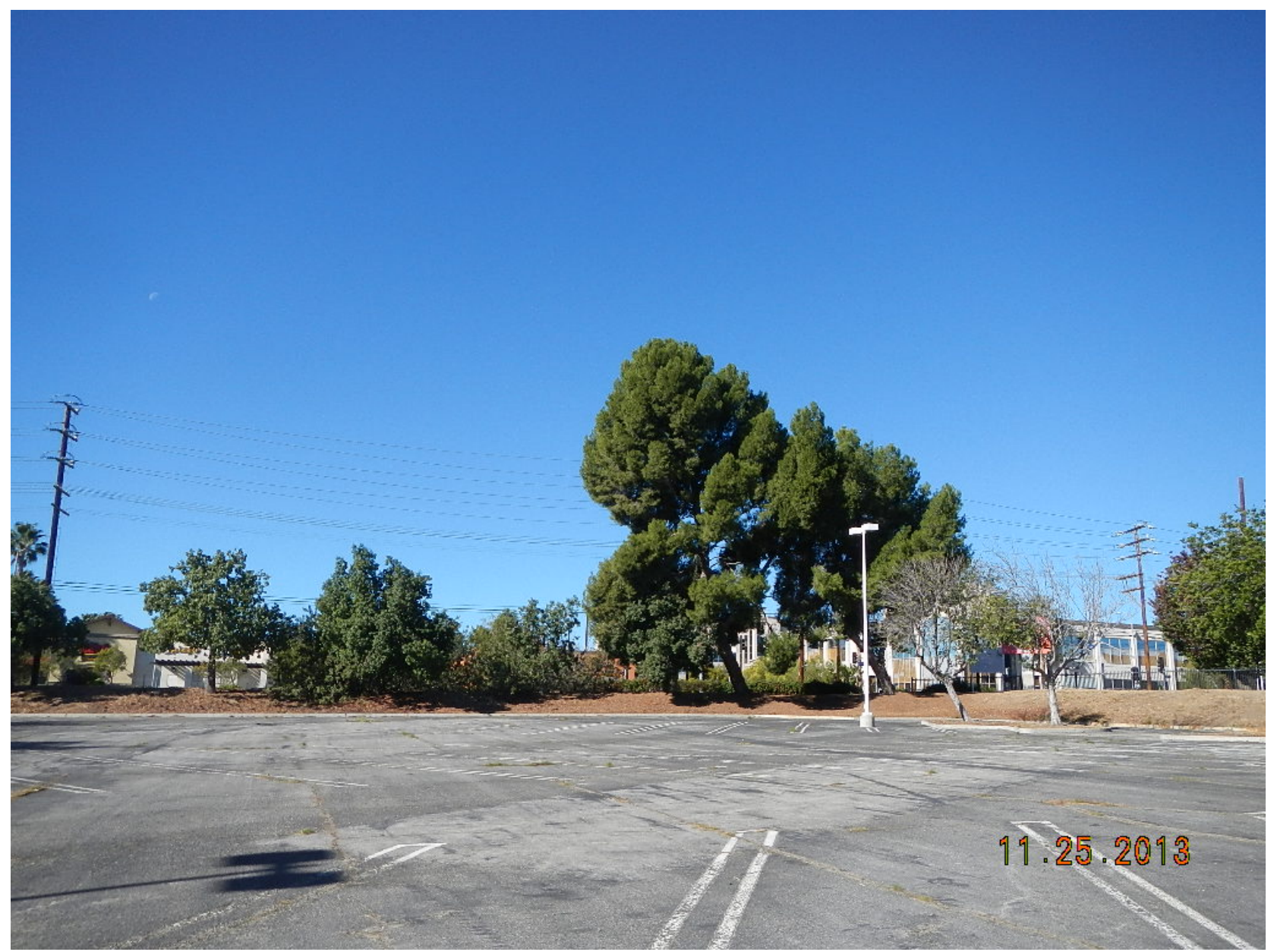
The northwest corner of the site. Note the sparse carrotwoods and leaning Aleppo pines.