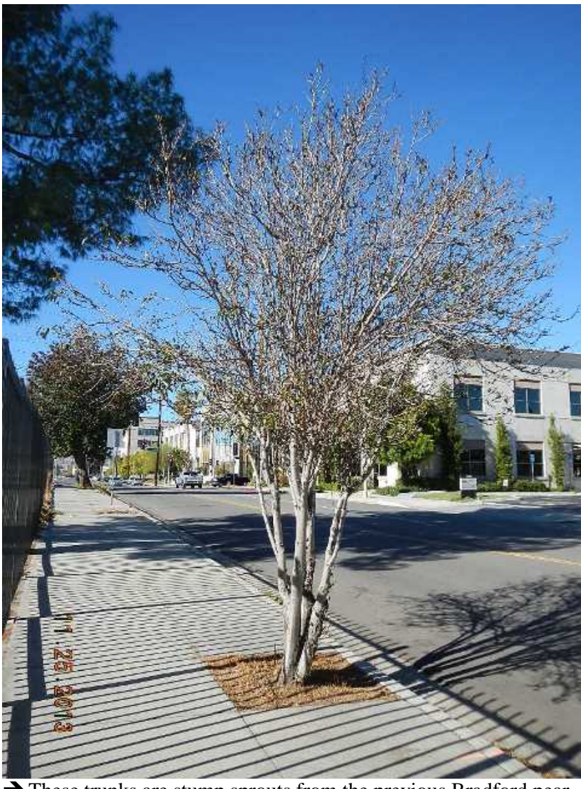
→ These trunks are stump sprouts from the previous Bradford pear. The next tree well is unoccupied.