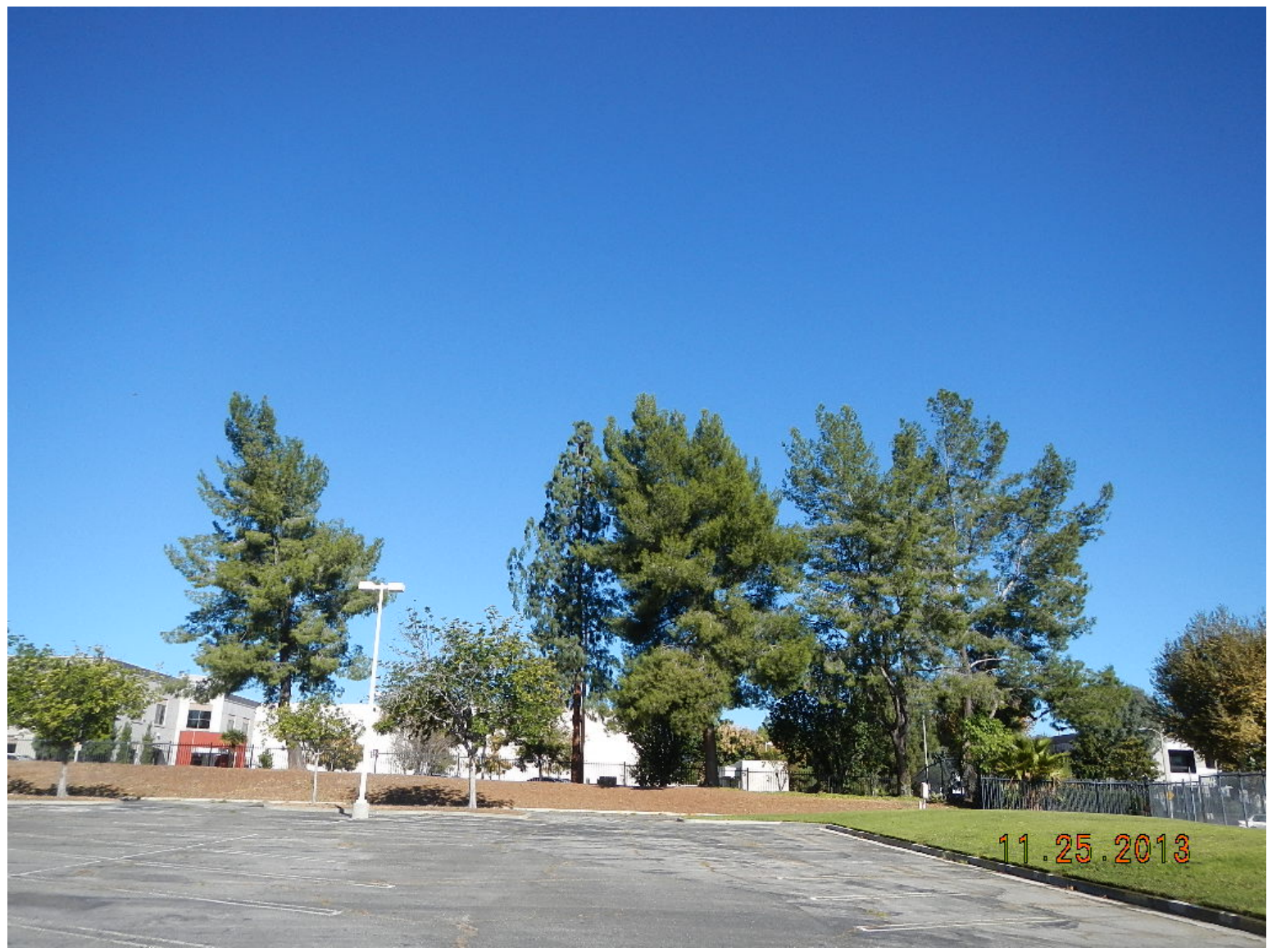
The northeast corner of the site. Note the sparse carrotwoods and tall Aleppo pines.