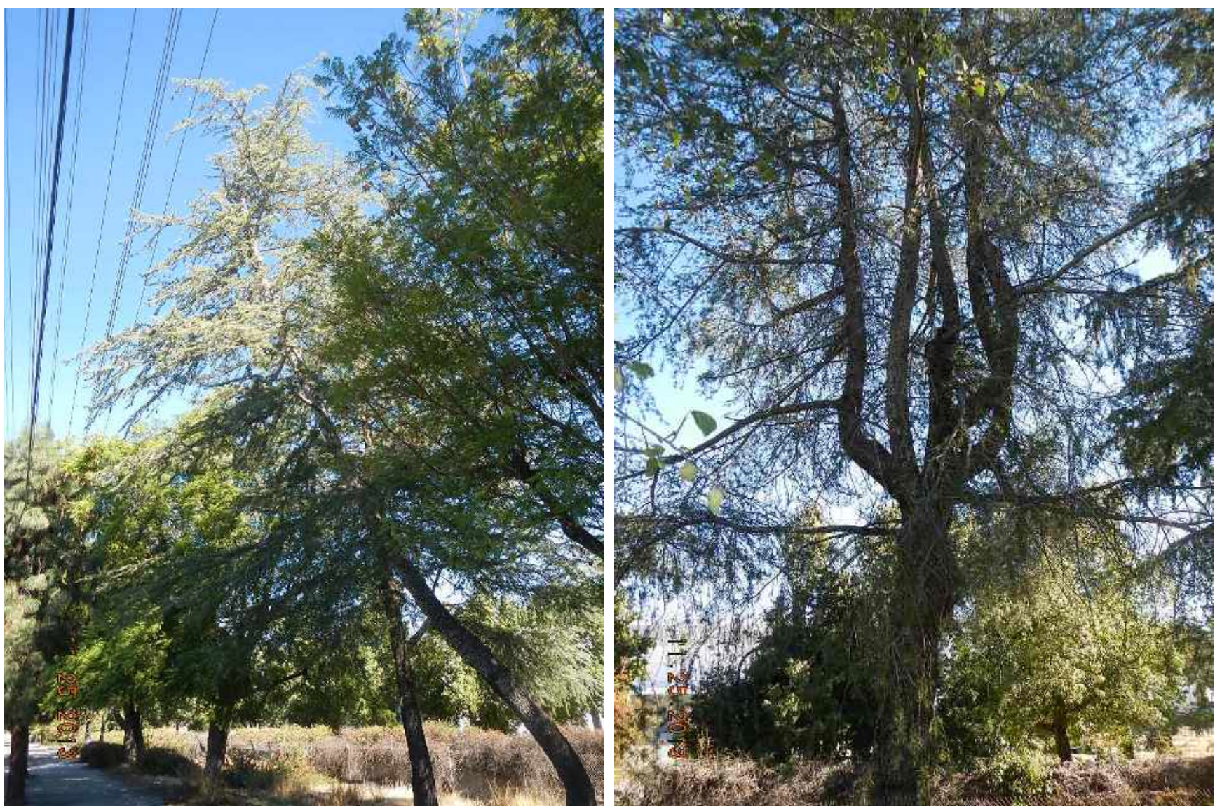
This deodar was leaning into the wires and had to be topped.