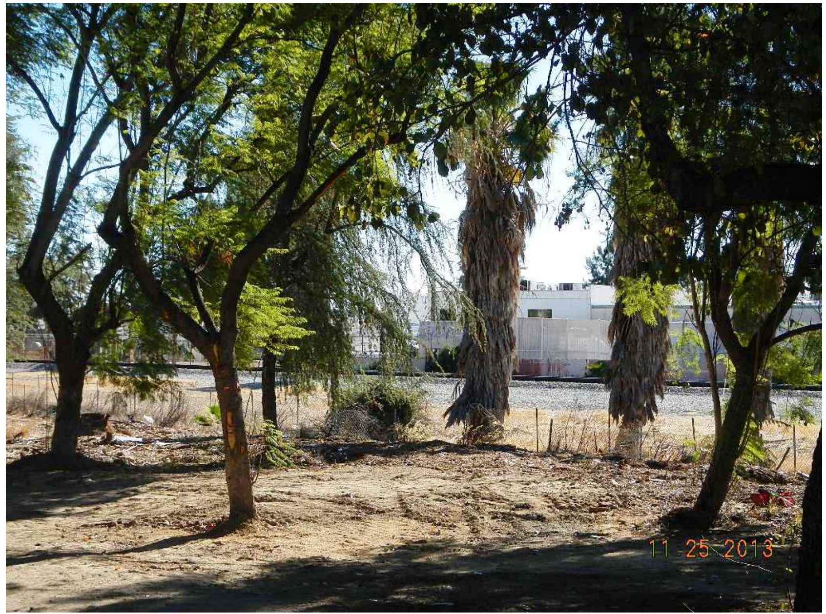
This area was graded and the equipment damaged tree trunks and limbs. Fill was left over the roots.