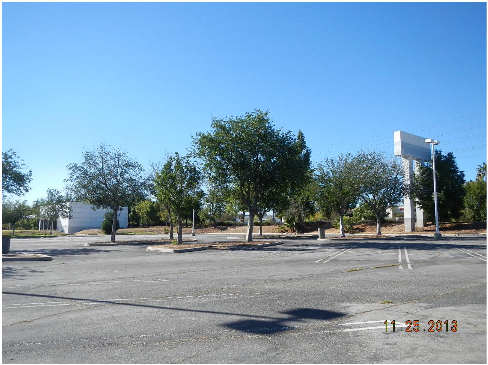
Carrotwoods in the parking islands and outside islands are sparse and declining, and their structure is weak.