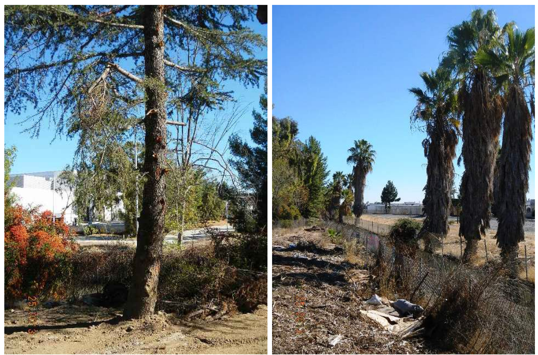
Note the recent damage to this deodar.