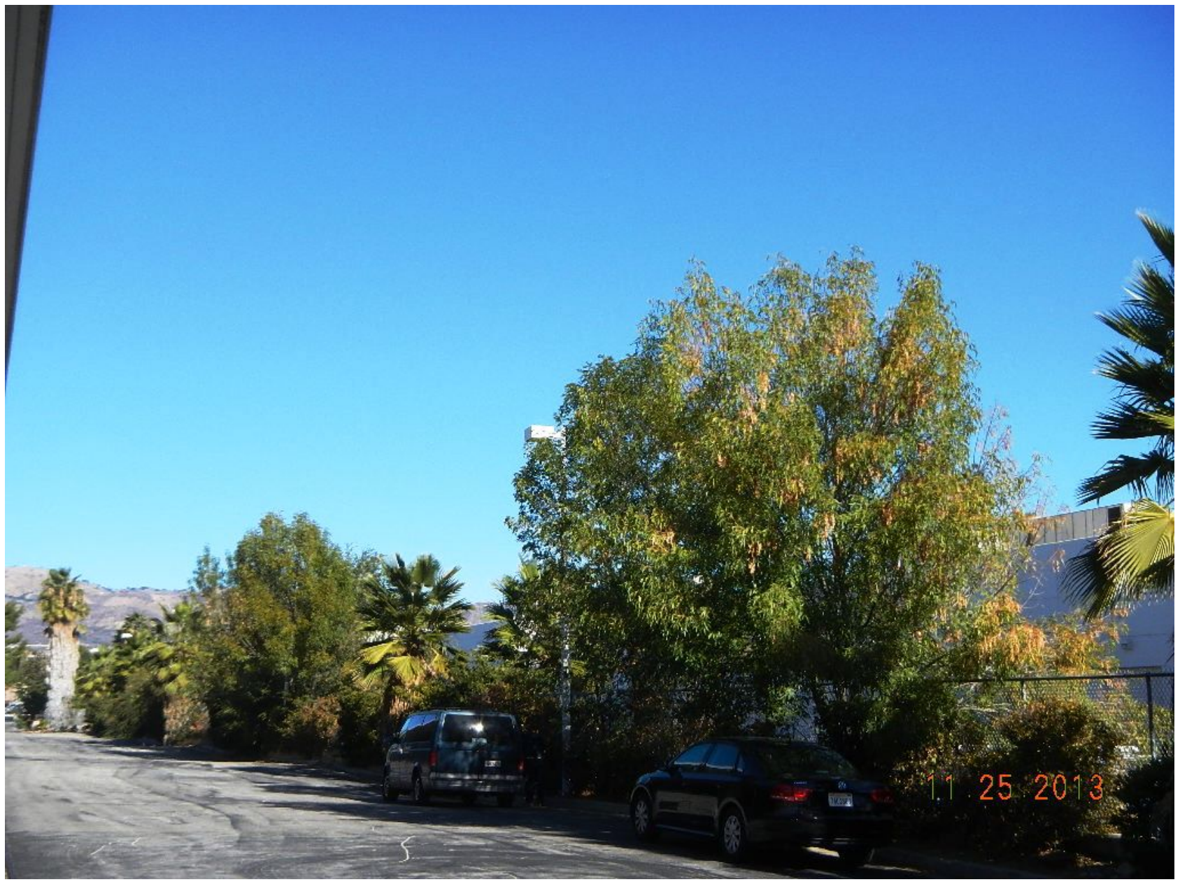
More Shamel ash weed trees along the east edge.