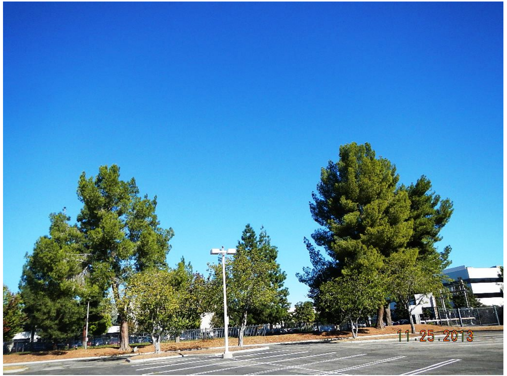
While the Aleppo pines are generally healthy, they have many structural weaknesses.