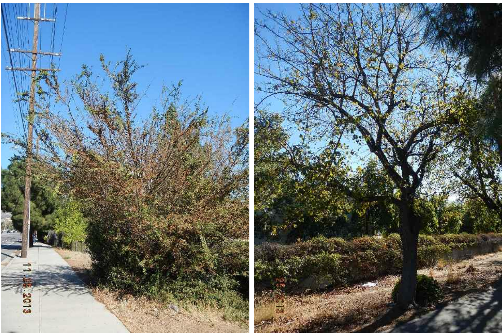
This Chinese elm is also a weed tree or stump sprout.