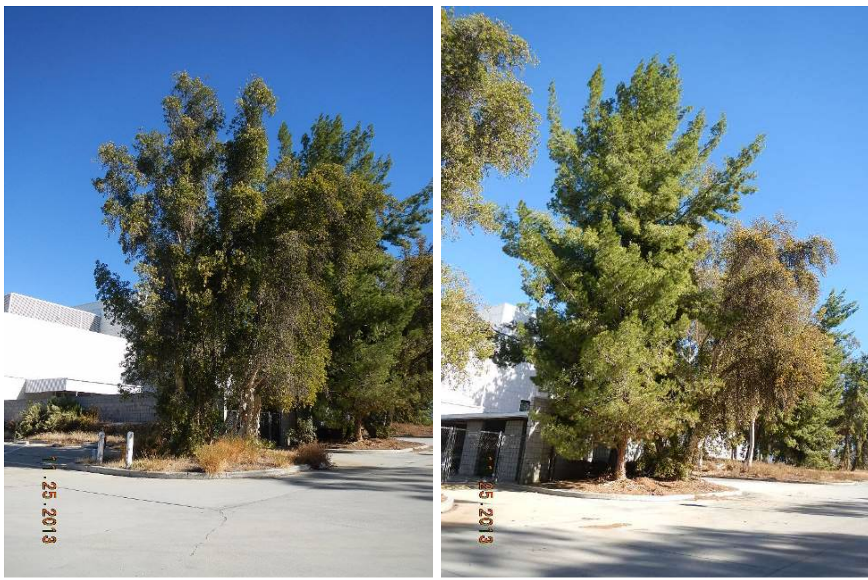
Paperbarks at southwest corner of the building are healthier.