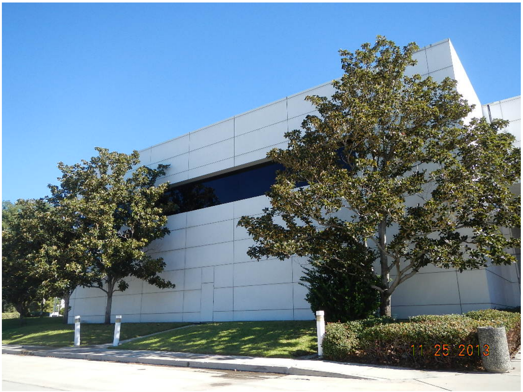
Magnolias along the west side of the building are adequately healthy.