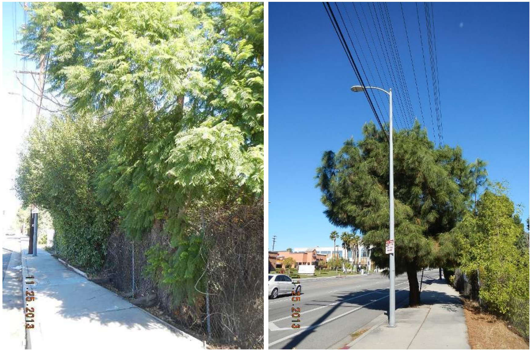
A jacaranda in a small opening and intertwined in the fence.