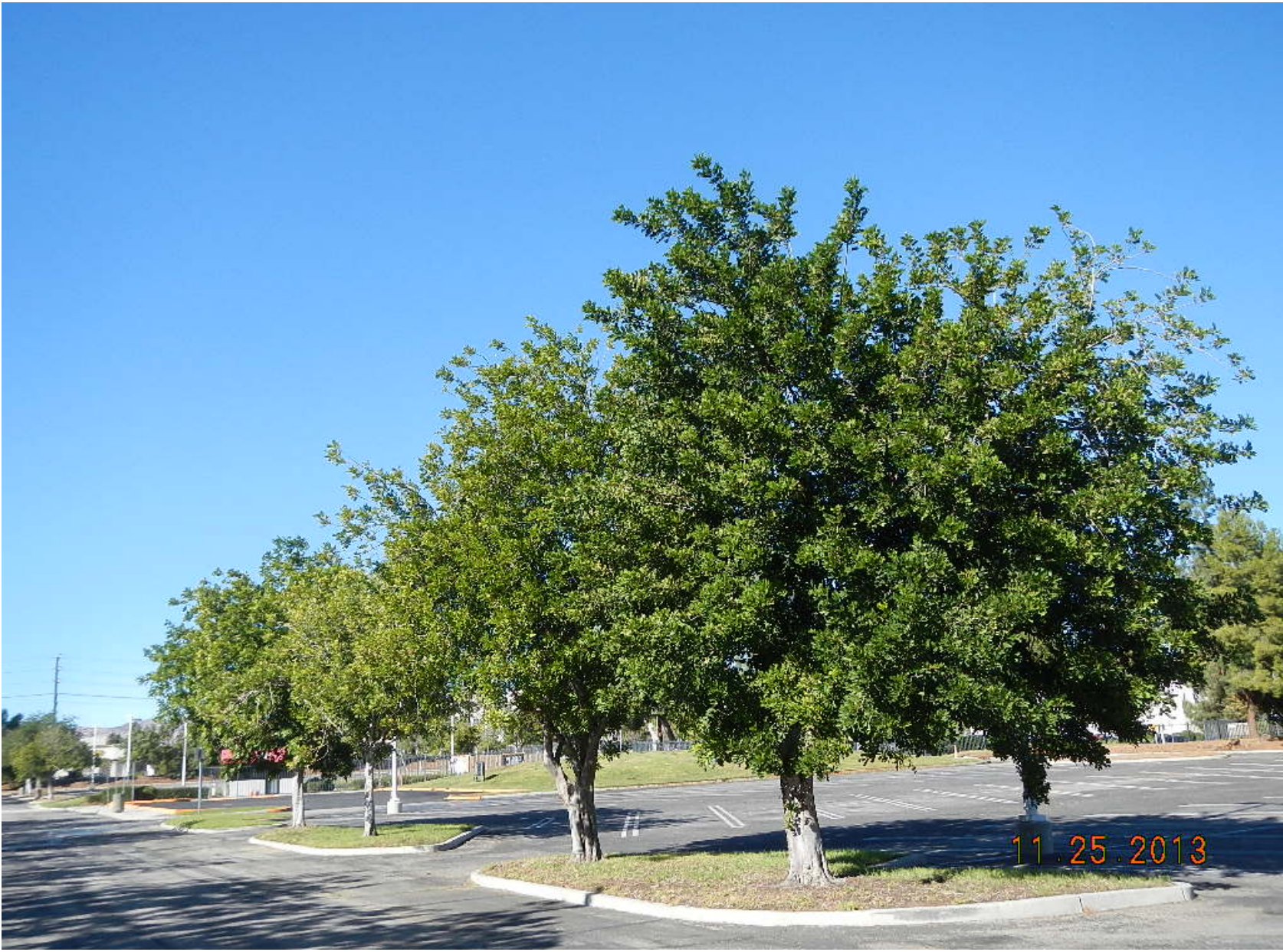
Carrotwoods are healthier in the northeast parking area, but weak structurally.