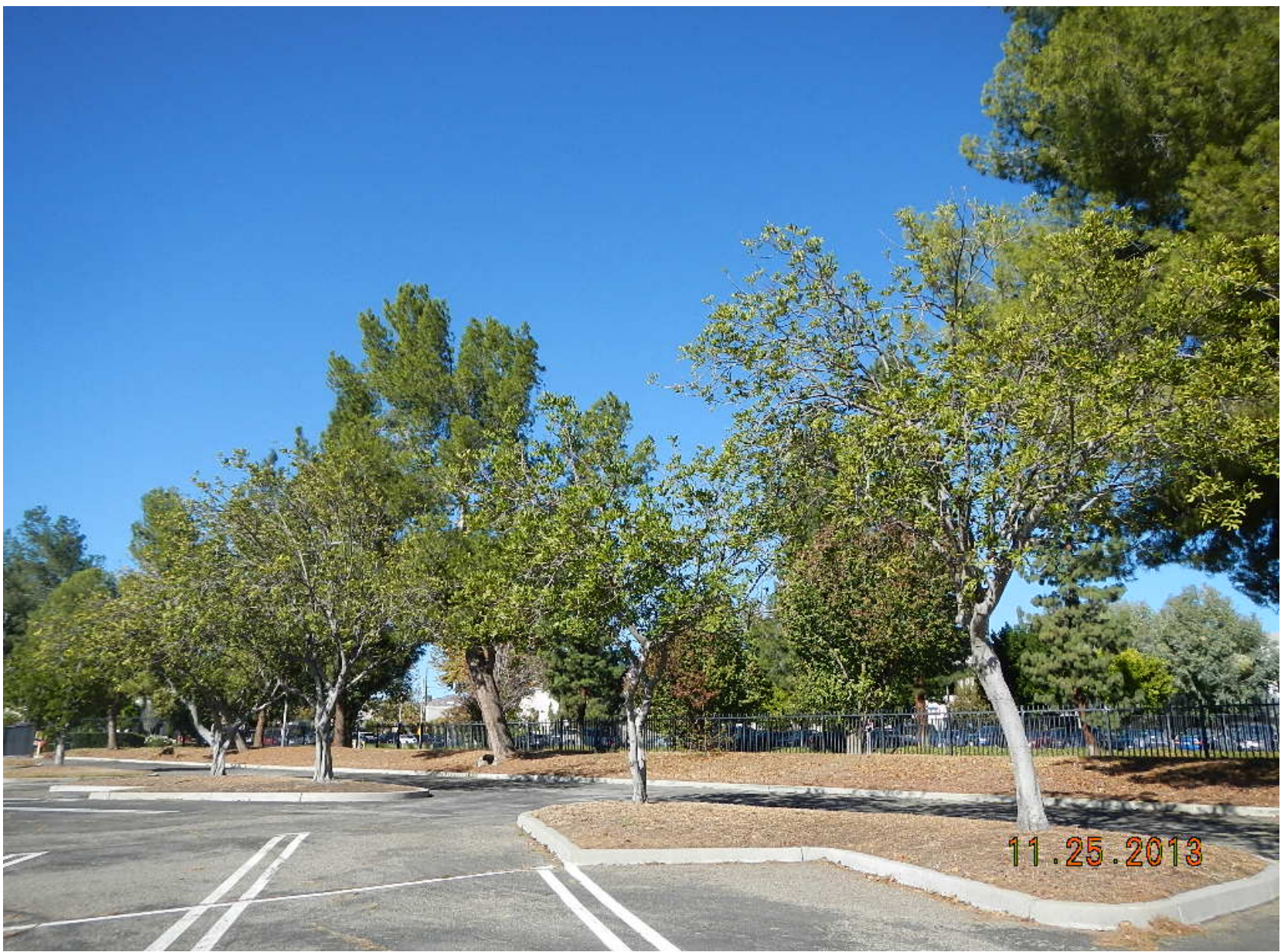
Carrotwoods are less healthy on the higher north edges of both sides, probably due to irrigation difference due to elevation.